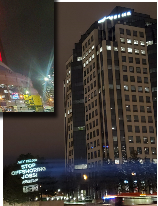
Consilium Place in Scarborough