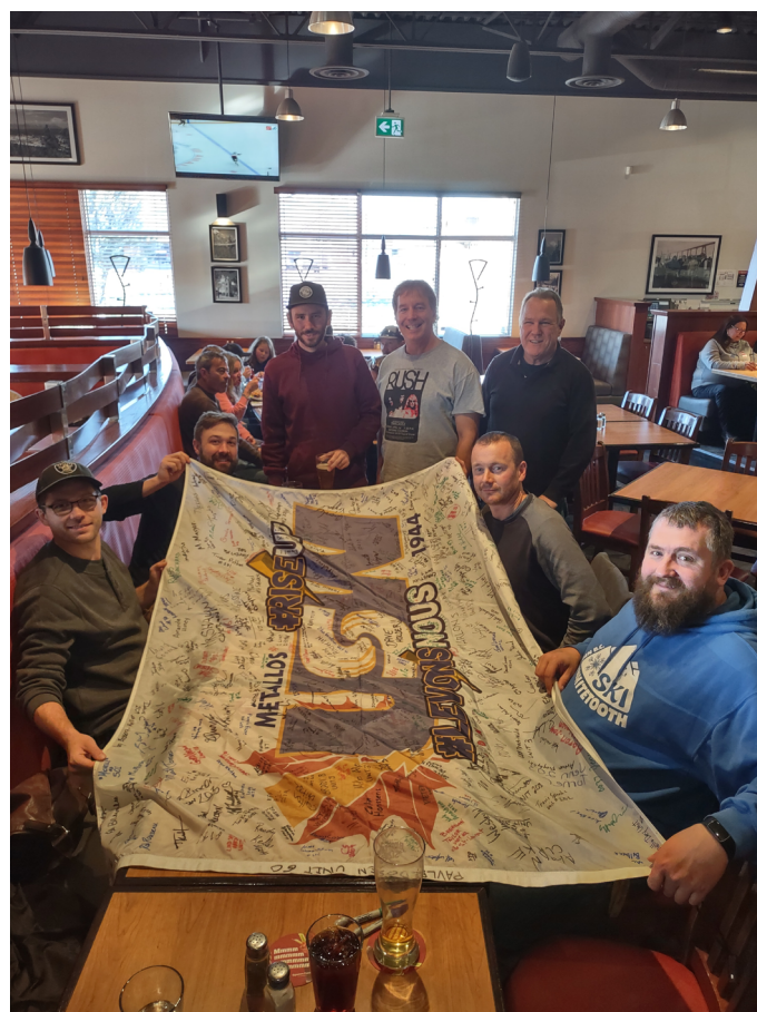
Unit 36 - Cranbrook- Plant