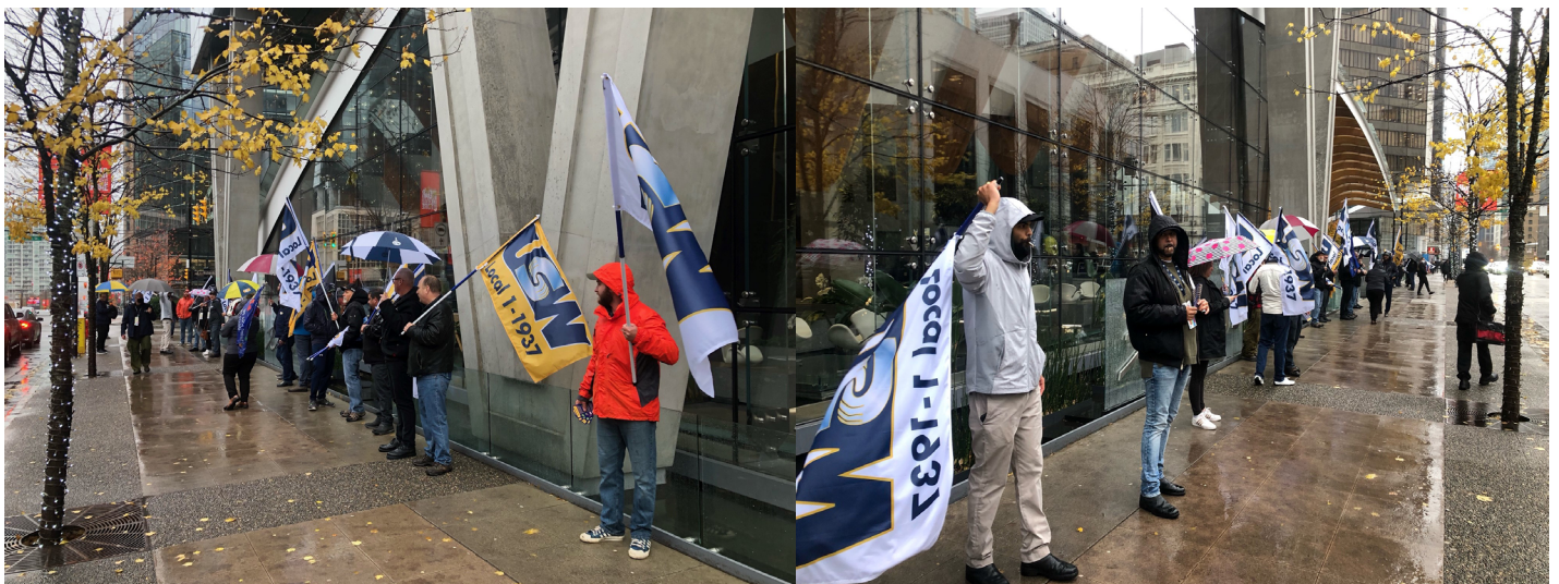
Supporters from other Steel Locals, and even other Unions, #RiseUP together during the BC Fed Convention