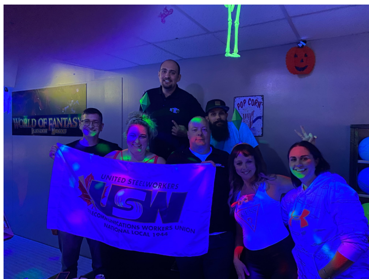
Unit 22 - Penticton - Plant