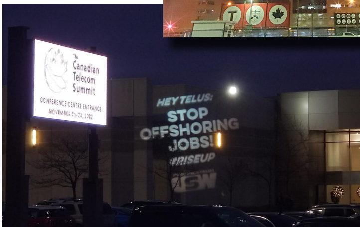
International Centre, home of the Canadian Telecom Summit