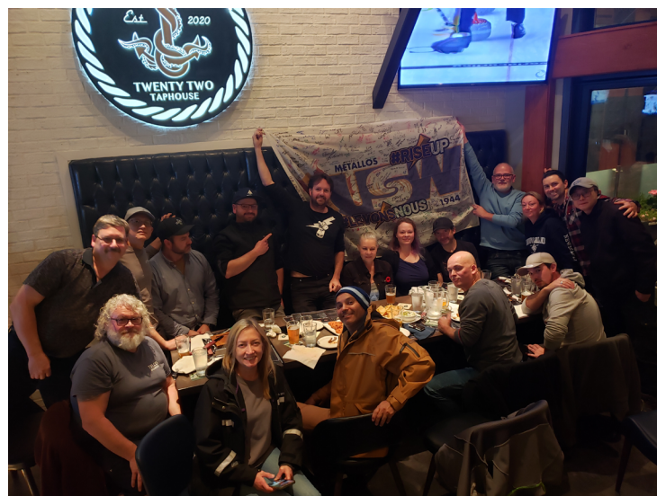
Unit 43 - Powell River/Sechelt - Plant

Check USW1944.CA for updates and info on when/ where to sign the flag when it comes to your Unit!