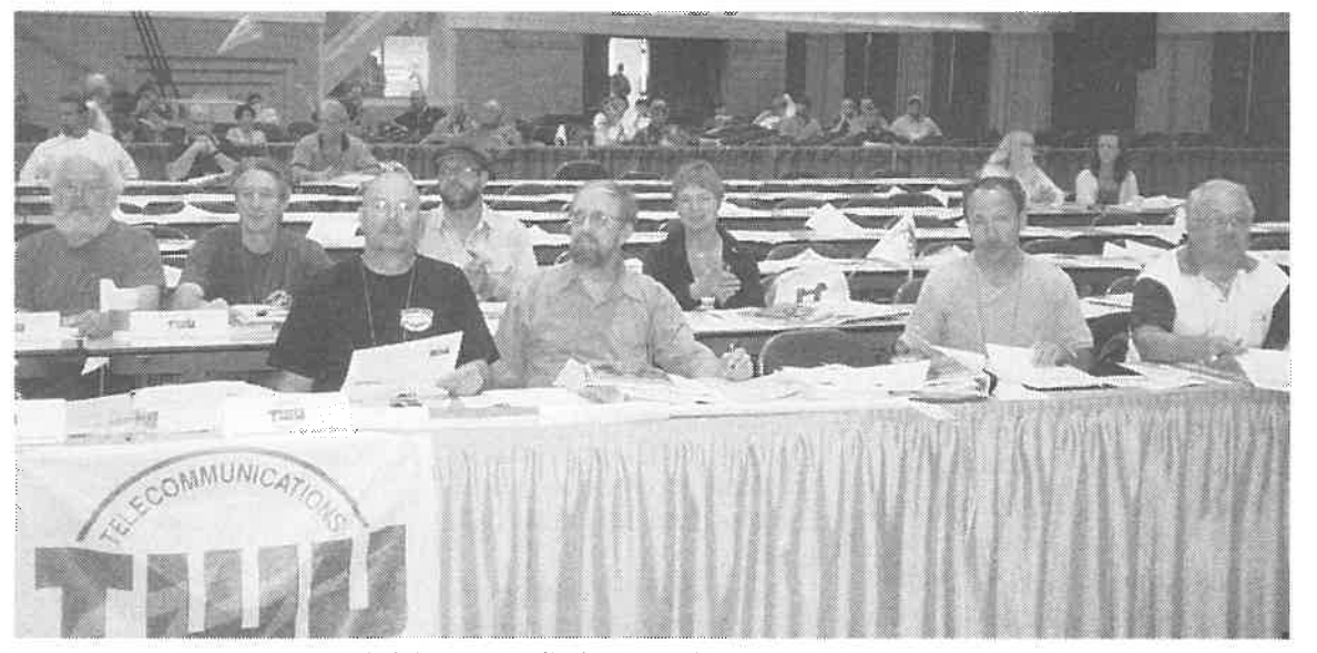
TWU delegates to CLC convention in Vancouver in June