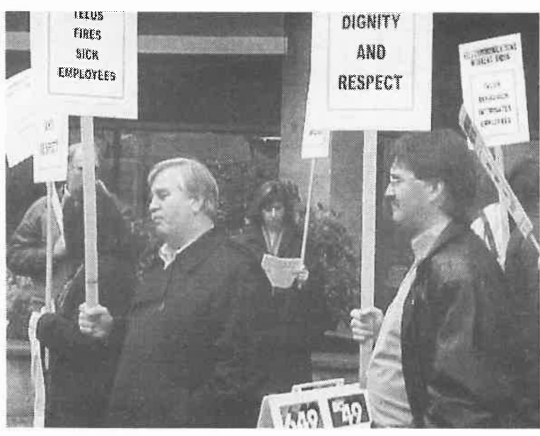
TWU officers, members rally outside New Westminster telesales office