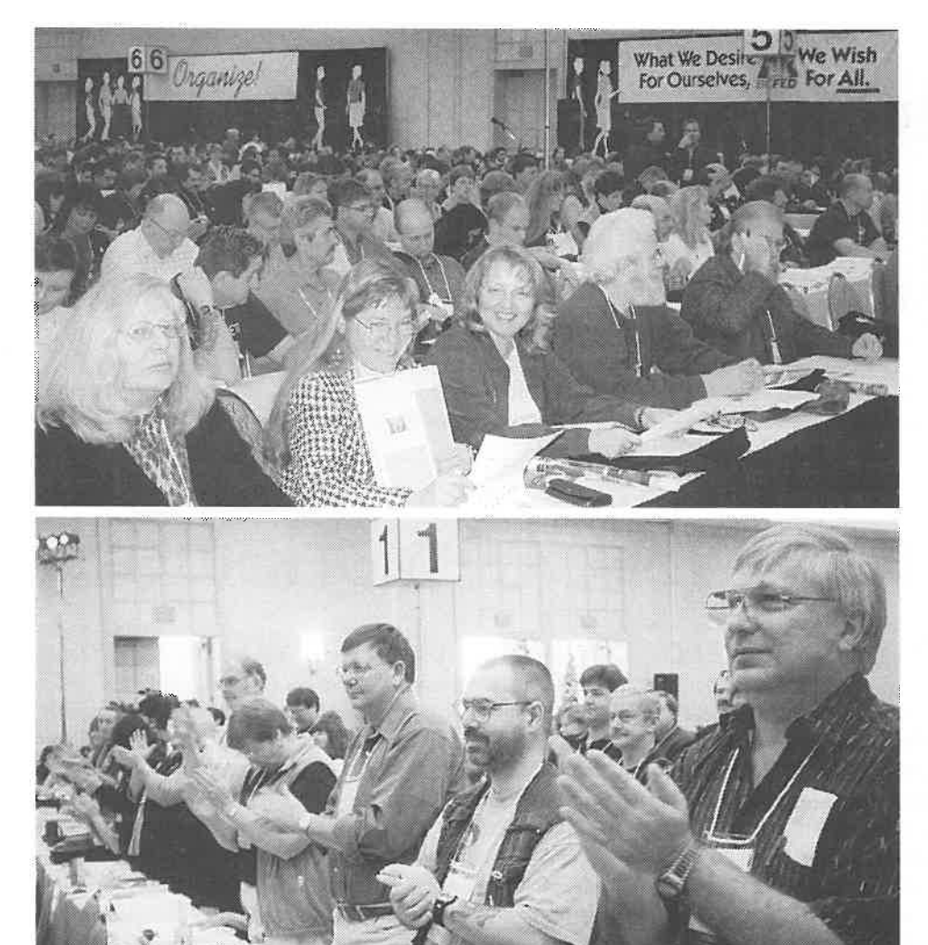
TWU delegates to BC Federation of Labour convention in Vancouver November 26-28