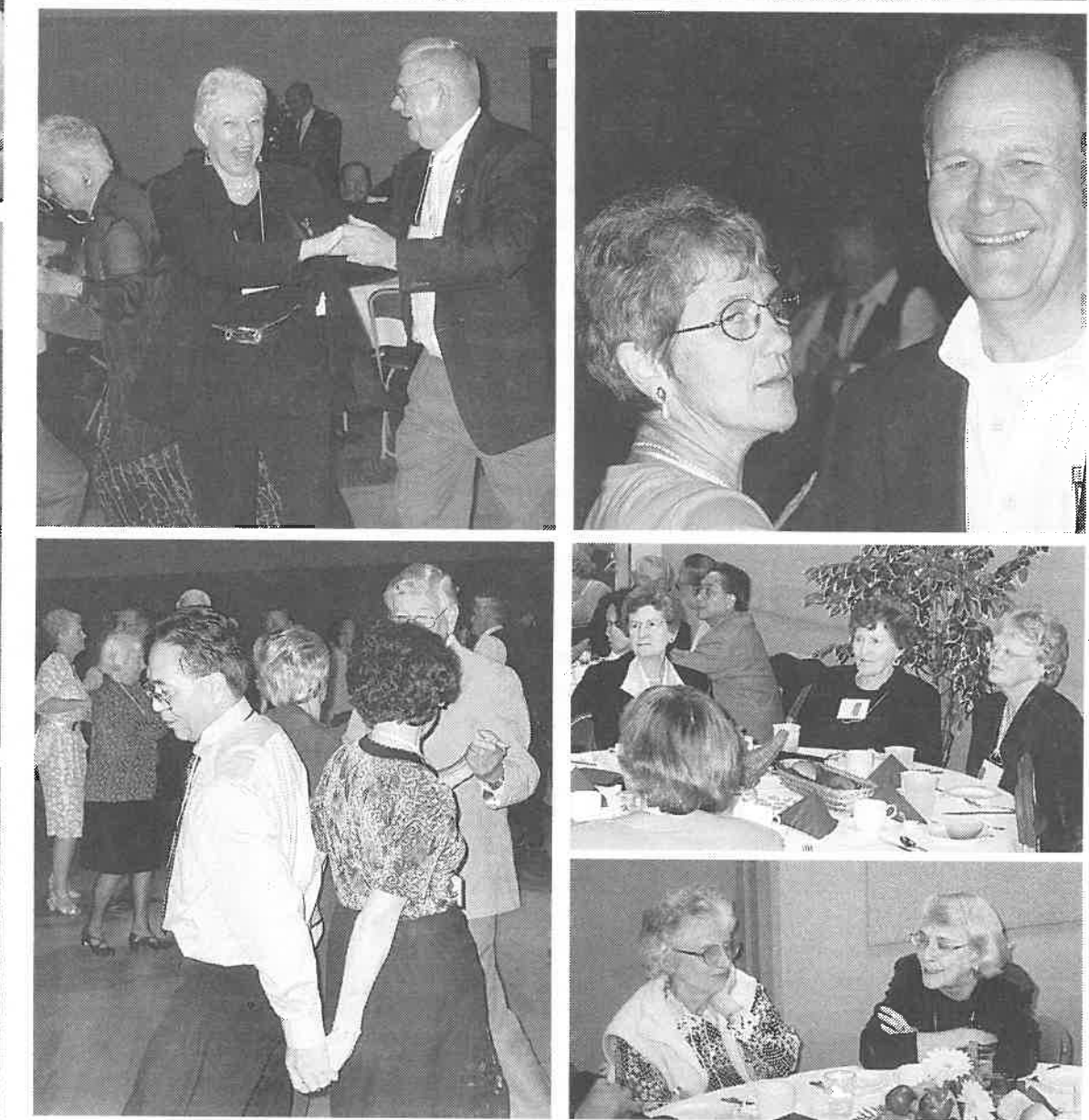
TRANSMITTER - December, 2001 - Page 7