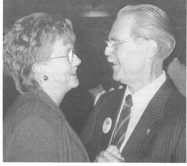
TRANSMITTER - February, 2000 - Page 7