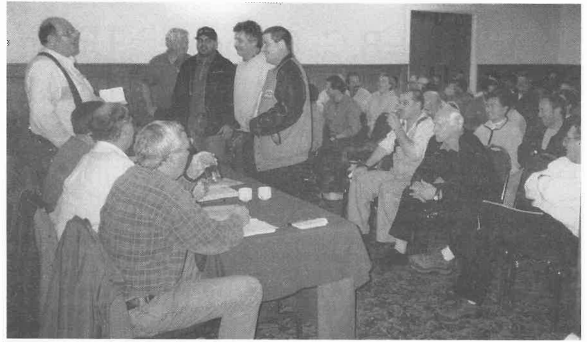
Rogers Cable Workers for Vancouver and Surrey give Union big strike mandate at meeting January 12